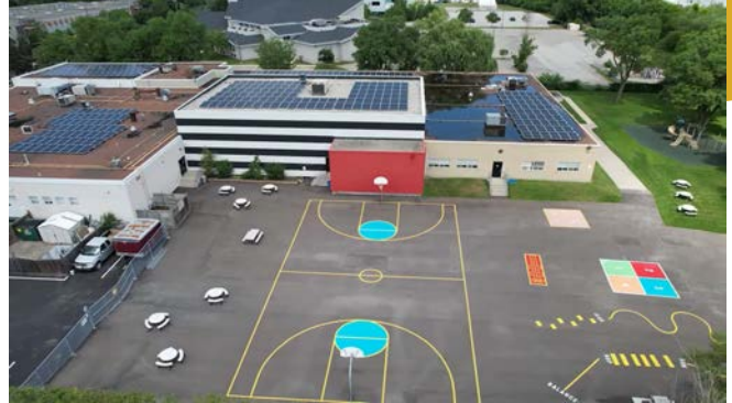
New Playground and Solar Panels