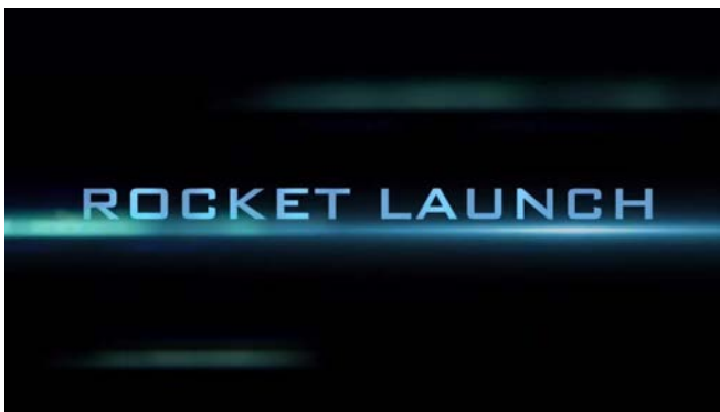
Physics 11 Class Rocket Launch