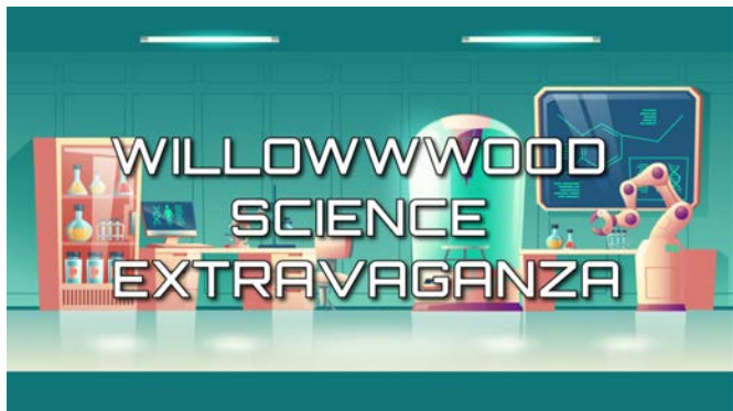
Science Show for Grades 1-6